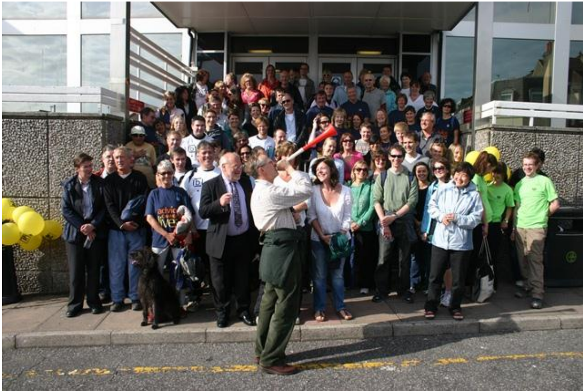
Here you all are

Even with a few last minute drop- outs 100 people walked in Brighton last night to raise funds for the legal advice services in the area.